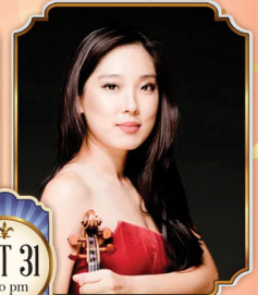
Grace Park violin